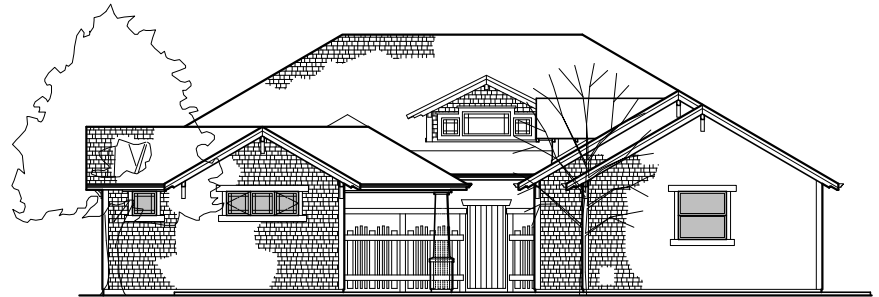
Elevation from driveway