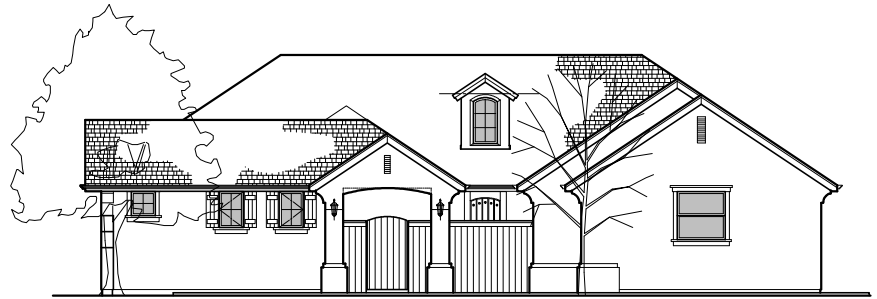
Elevation from driveway